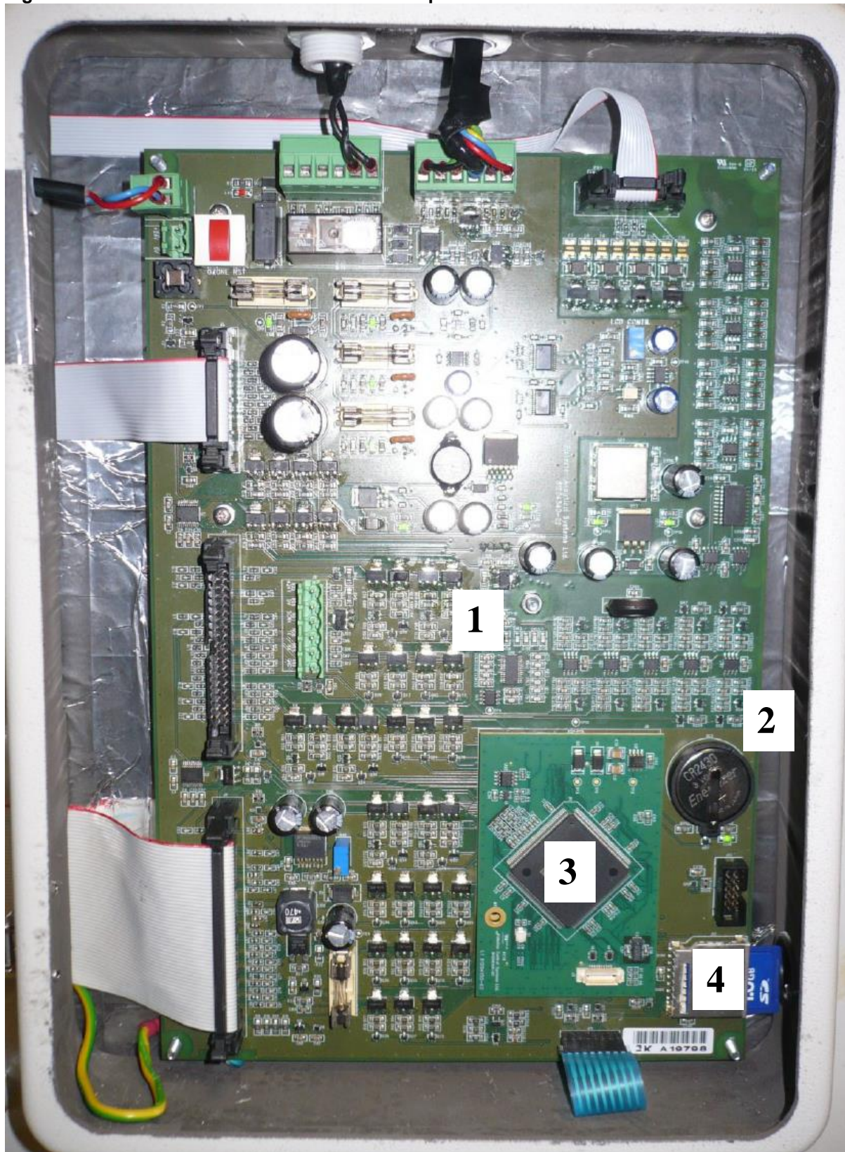
Figure 3 BioTector motherboard enclosure components

Figure 3 and table 3 below shows the BioTector motherboard enclosure components.